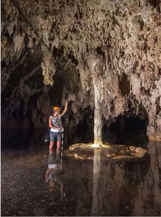
Parts of the cave system have already collapsed due to wide passages